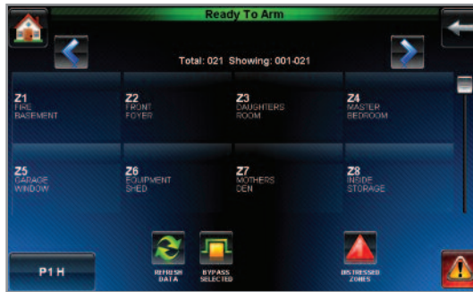
Zone List Screen